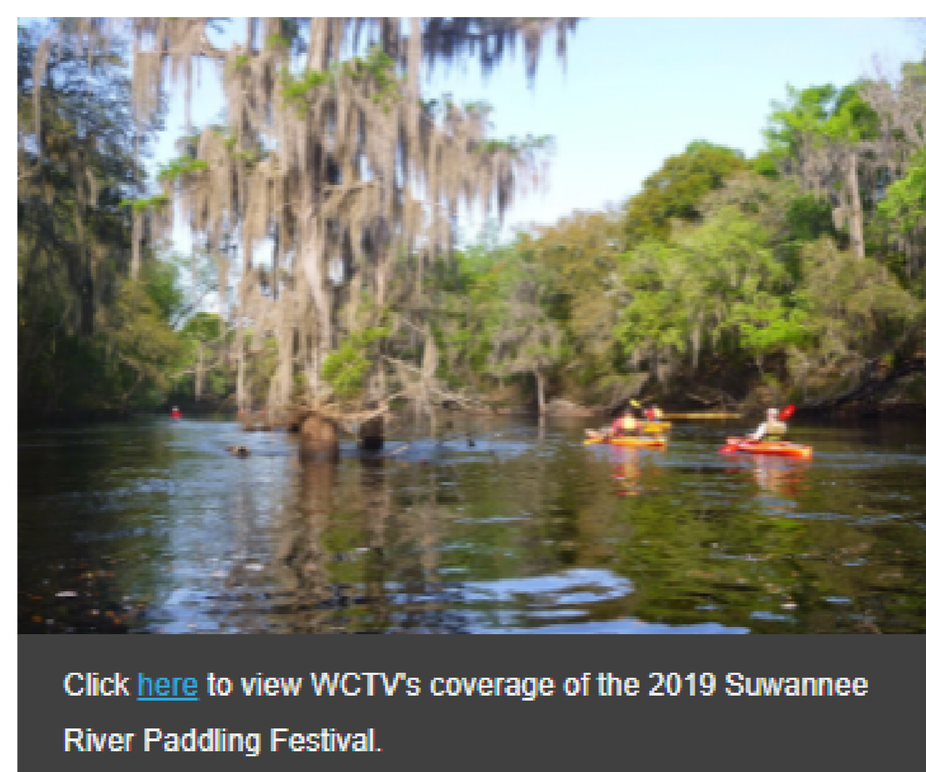
Click here to view WCTV's coverage of the 2019 Suwannee River Paddling Festival.