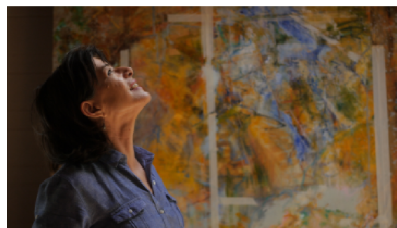
Click on the image above to view the Lost Springs documentary by Matt Keene.