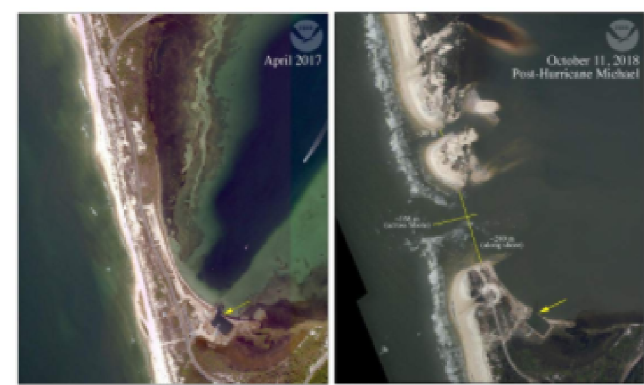
Photo: Aerial of St. Joseph Peninsula State Park

Hurricane Michael was so powerful that when it hit the Florida Panhandle last fall, it tore a state park in two.